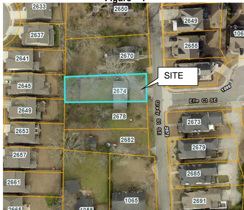
Figure – 1

The applicant is requesting a reduction of the rear setback from 5 feet to 3.8 feet, and side setback from 5 feet to 2.8 feet at 2674 Grady Street. According to Section 1403 of the Zoning Ordinance, variances must be reviewed under the following standards: (1) Whether there are unique and special or extraordinary circumstances applying to the property; (2) Whether any alleged hardship is self-created by any person having an interest in the property; (3) Whether strict application of the relevant provisions of the code would deprive the applicant of reasonable use of the property; and (4) Whether the variance proposed is the minimum variance needed. Community Development has reviewed the requests against the variance review standards and found neither setback reduction to be in compliance with the review standards. Community Development believes that the setback reductions will result in adverse impacts on adjacent properties when there is ample space to move the shed to meet code. Therefore, Community Development recommends denial of the rear and side setback requests. In addition, at the time of this report, Community Development has received two phone calls in opposition to the variance request.