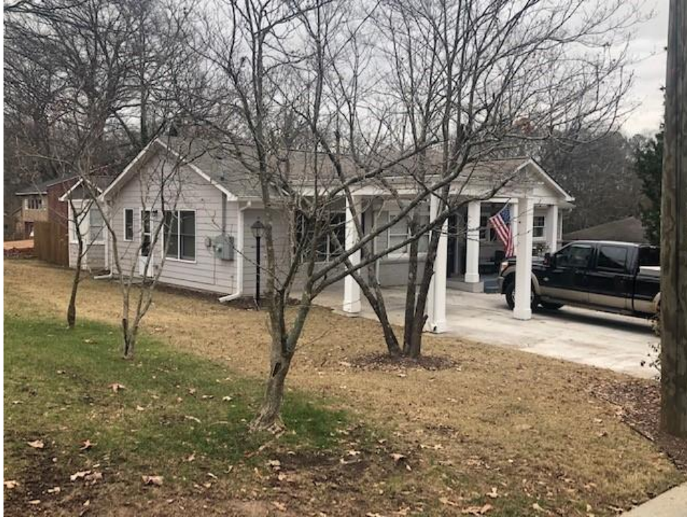
Figure – 5 Adjoining Property across Whitfield Street