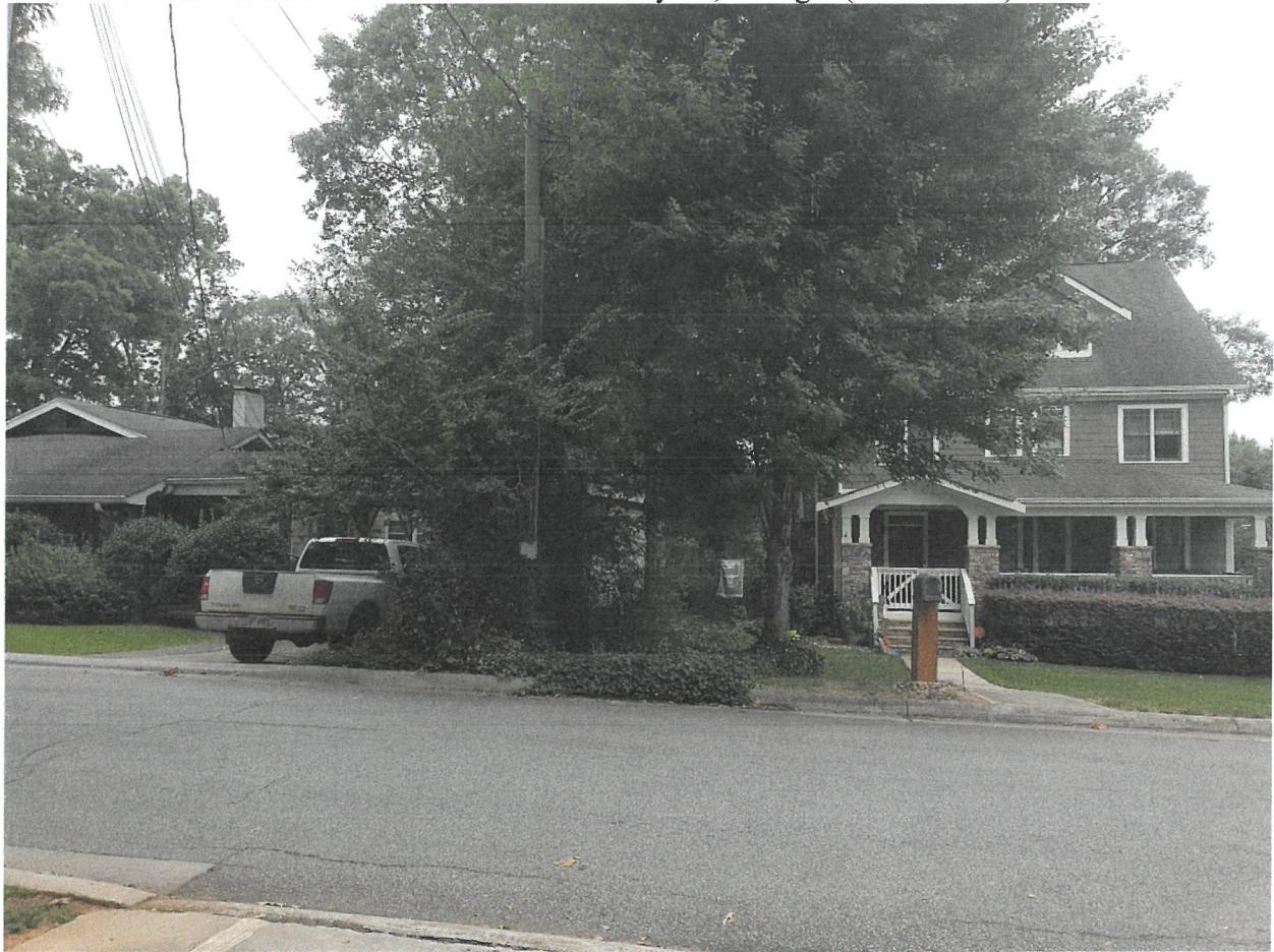
New House next door to 1528 Whitefield Dr. Smyrna, Georgia (EXIBITE 1)