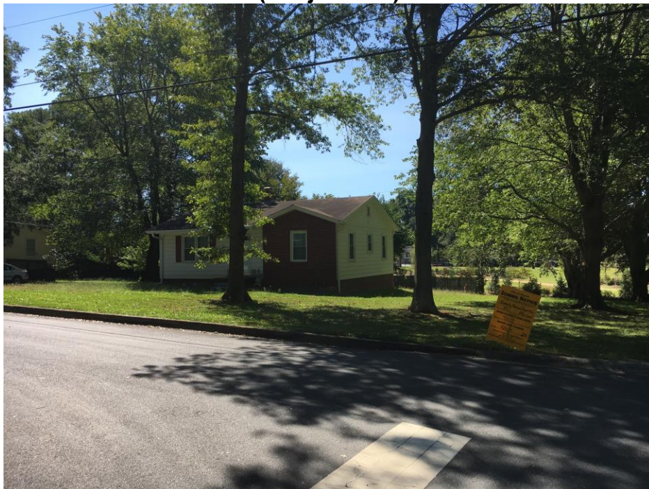
Figure – 1 (Subject Site)