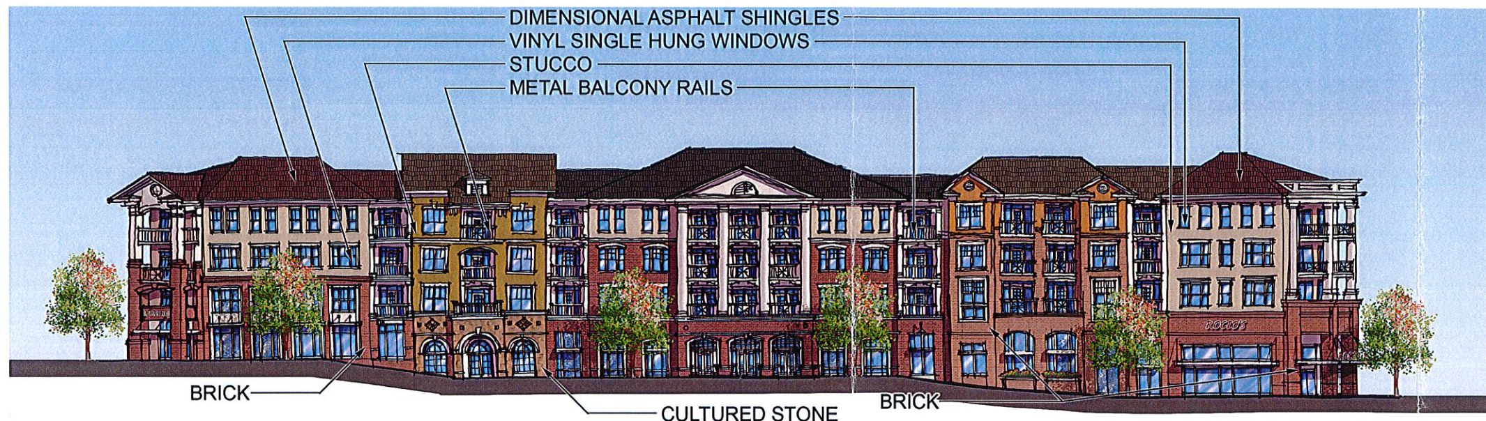
POD "B" - WEST ELEVATION

NOT ISSUED FOR CONSTRUCTION © 2009 THE PRESTON PARTNERSHIP, LLC