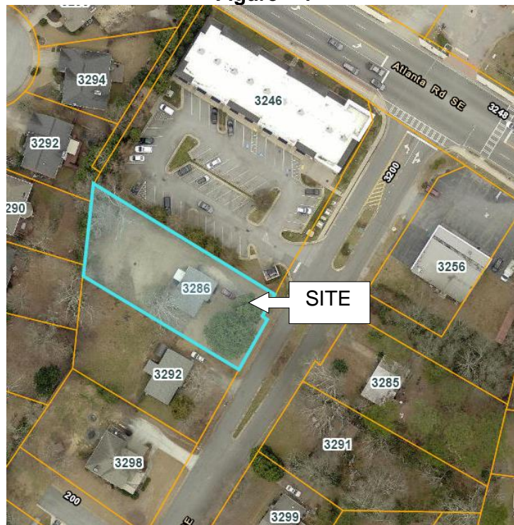
Figure – 1