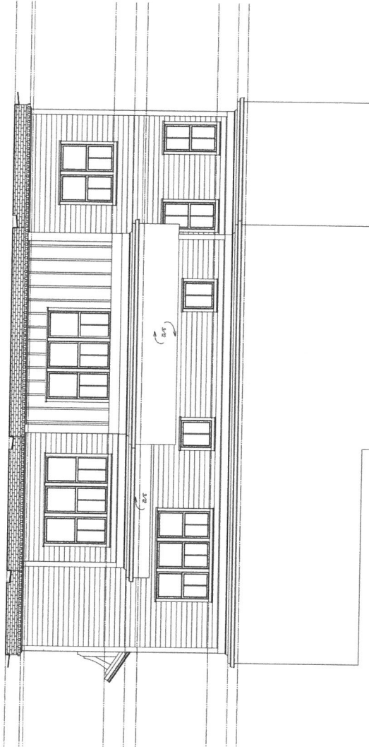
2 REAR ELEVATION SCALE 1/4" = 1'-0"