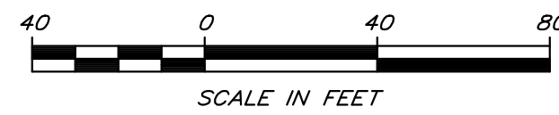
INTERSECTION SIGHT DISTANCE PLAN VIEW SCALE: 1"=40'

PROFILE SCALE : HORIZ. - 1" = 100', VERT. - 1" = 20