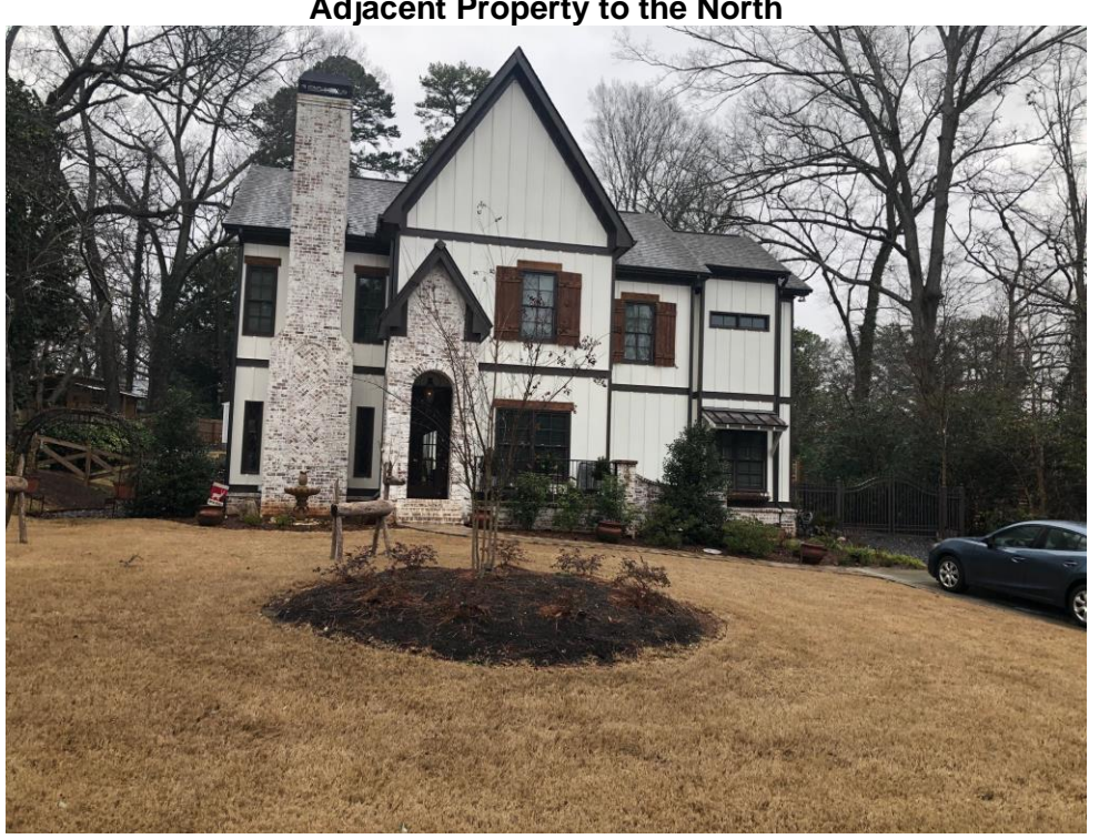
Figure – 4 Adjacent Property to the North