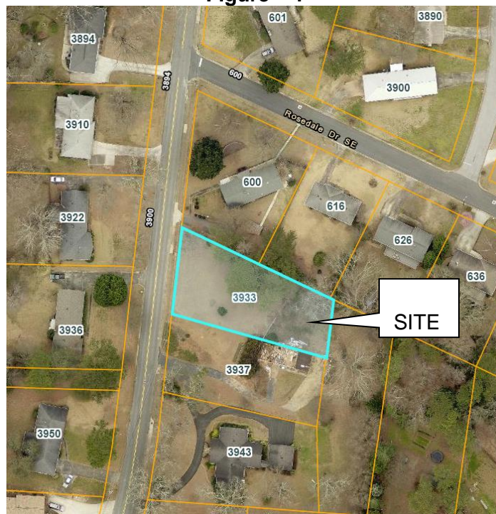
Figure – 1

According to Section 1403 of the Zoning Ordinance, variances must be reviewed under the following standards: (1) Whether there are unique and special or extraordinary circumstances applying to the property; (2) Whether any alleged hardship is self-created by any person having an interest in the property; (3) Whether strict application of the relevant provisions of the code would deprive the applicant of reasonable use of the property; and (4) Whether the variance proposed is the minimum variance needed. Community Development has reviewed the request against the variance review standards and found it not to be in compliance with any of the standards , based on the lack of hardship and the self-creation of the variance request. Staff is not supportive of reducing the driveway side setback when adjustments could be made to accommodate City code. Community Development believes there are no unique and special extraordinary circumstances applying to the property to justify the variance requested. Strict application of the ordinance does not deprive the subject property owner of reasonable use of the property, as the lot can accommodate a single-family home to Code. After a review of the standards above, Community Development recommends denial of the requested variance.