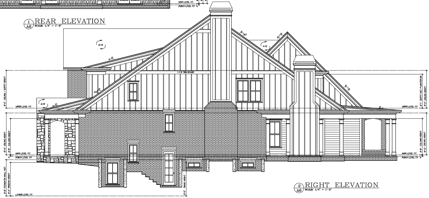
2 RIGHT ELEVATION A6 SCALE: 1/4" = 1'-0"