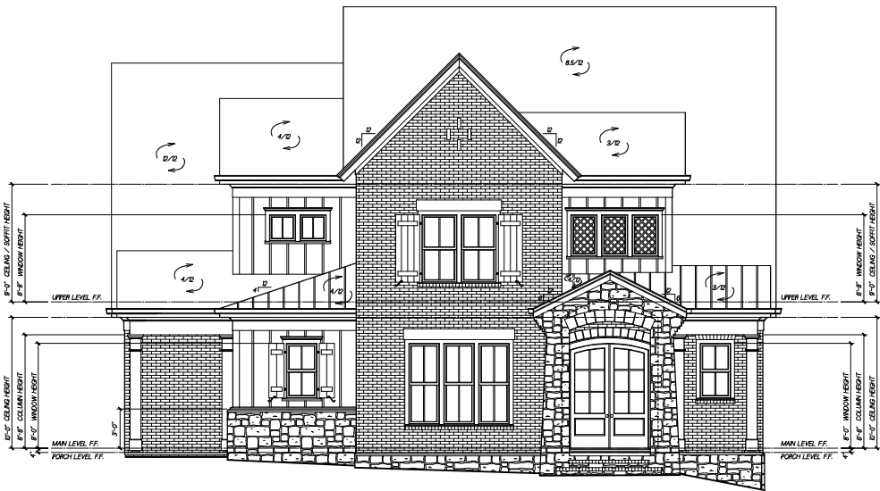
1 FRONT ELEVATION A5 SCALE: 1/4" = 1'-0"