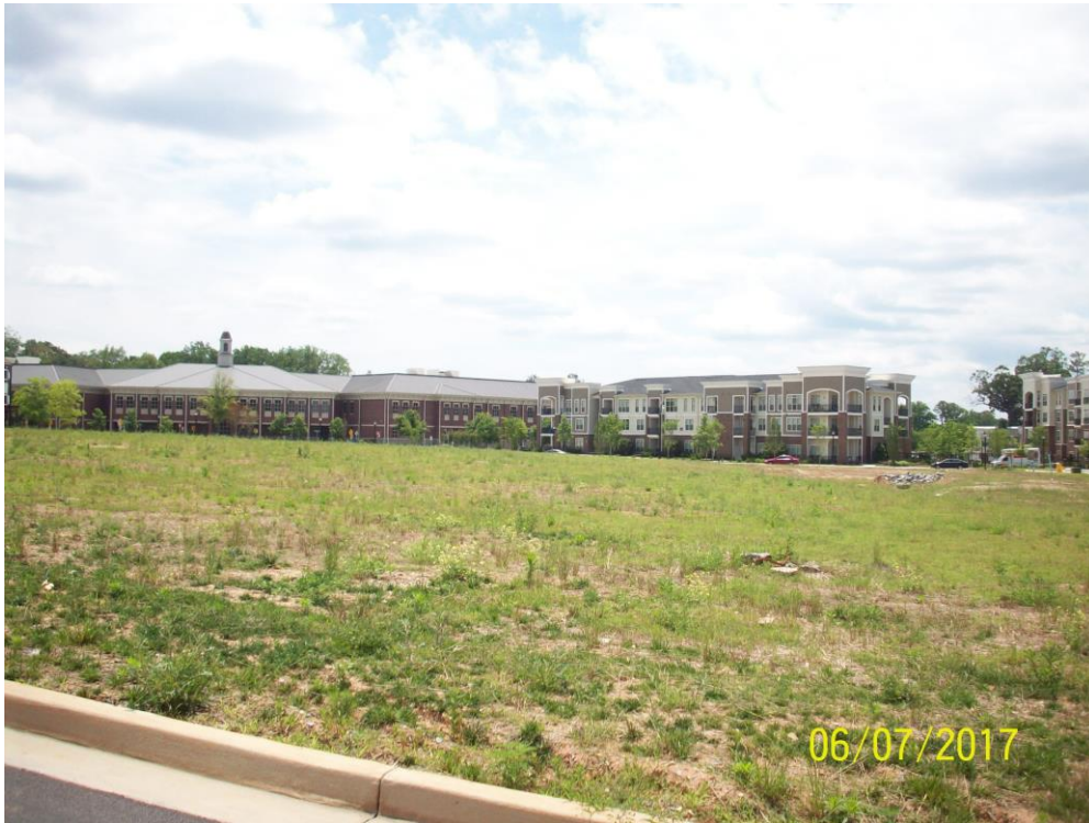
Figure – 2 (Adjacent Properties)