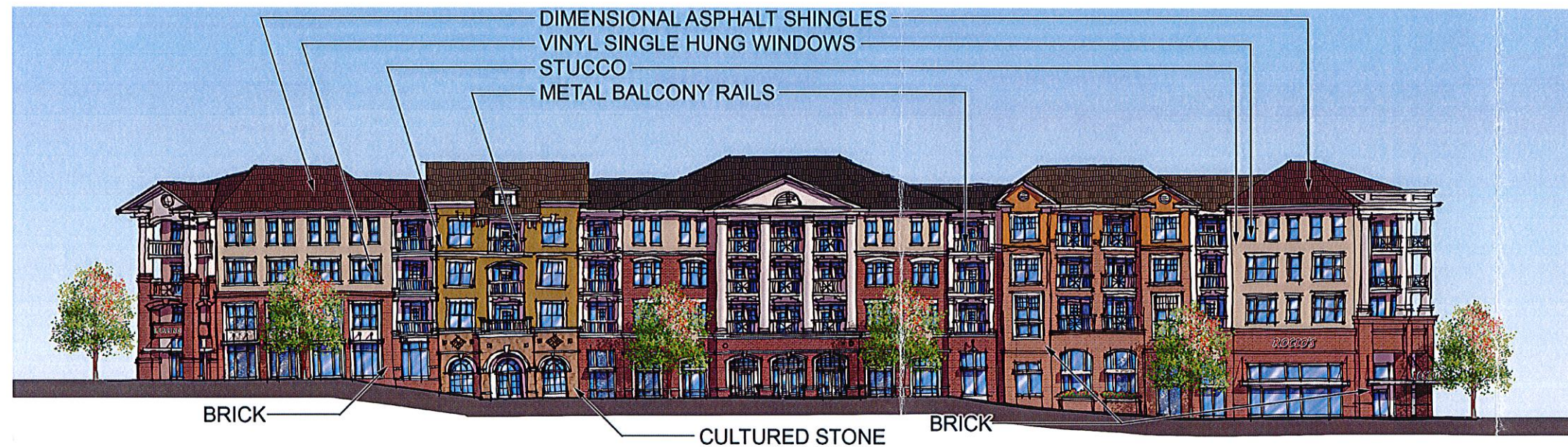
POD "B" - WEST ELEVATION