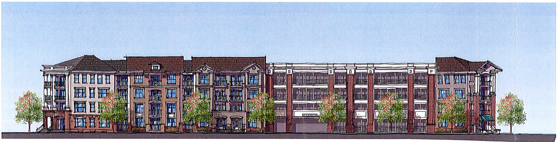
POD "B" - NORTH RESIDENTIAL ACCESS ROAD ELEVATION SCALE: 3/32" = 1'-0"

NOTE: FINAL ELEVATIONS MAY VARY SLIGHTLY AS A FUNCTION OF FINAL UNIT DESIGN.