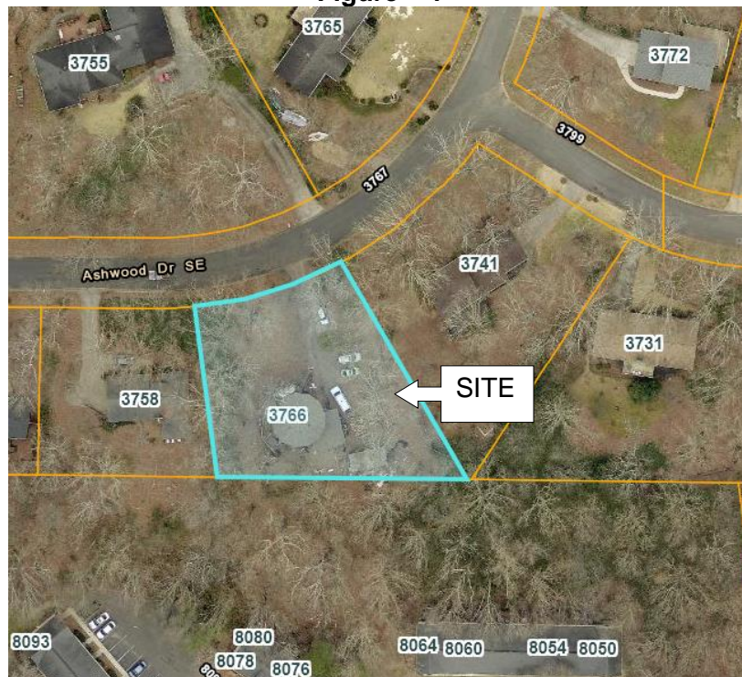
Figure – 1