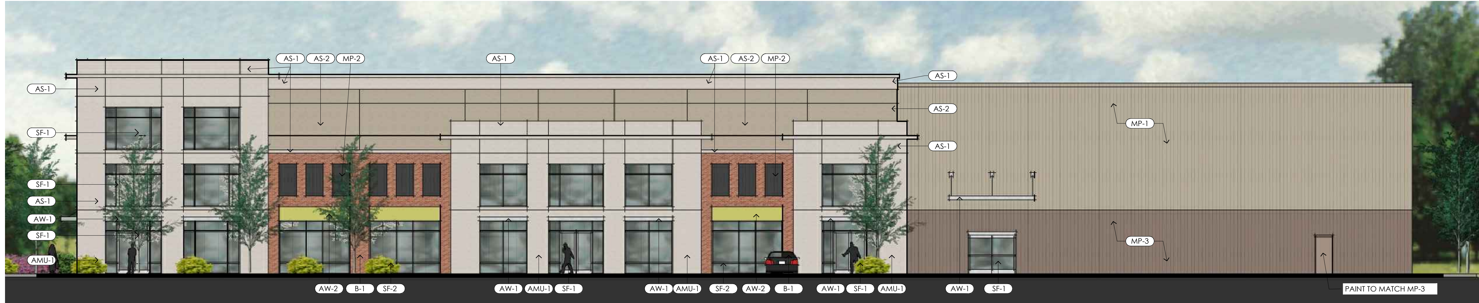
02 WEST ELEVATION A2.1 SCALE: 3/32"=1'-0"