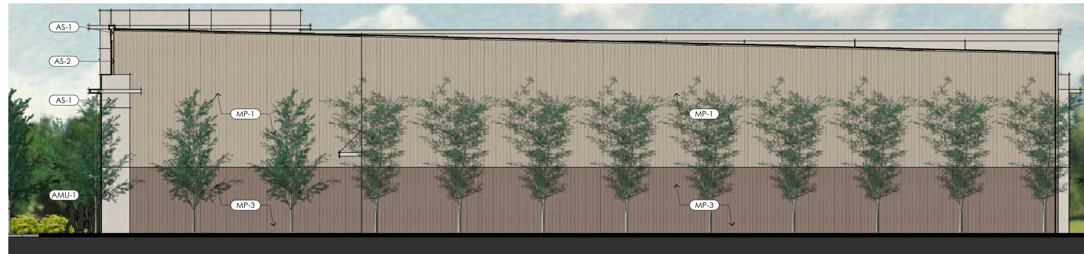
01 SOUTH ELEVATION A2.1 SCALE: 3/32"=1'-0"