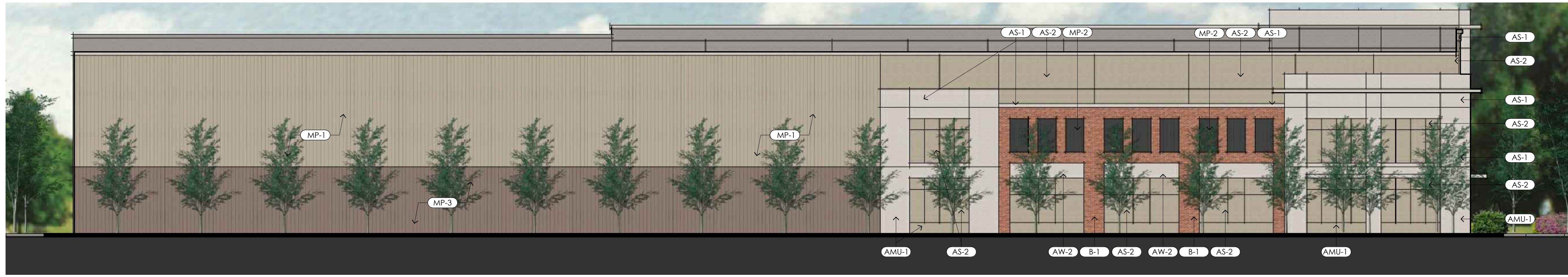
04 EAST ELEVATION A2.1 SCALE: 3/32"=1'-0"