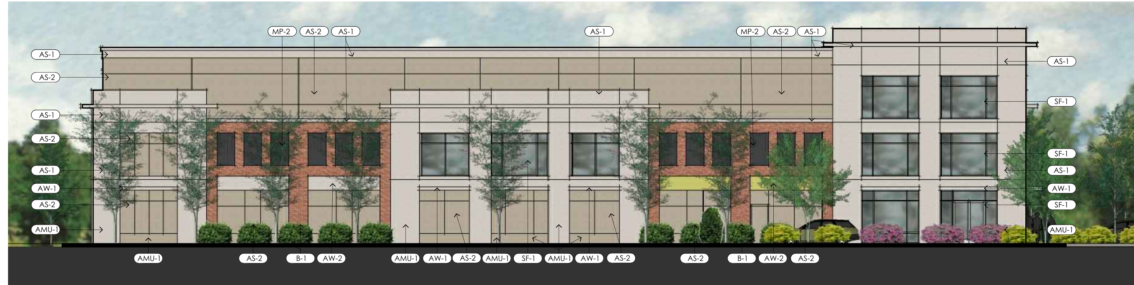
03 NORTH (SPRING ROAD) ELEVATION A2.1 SCALE: 3/32"=1'-0"