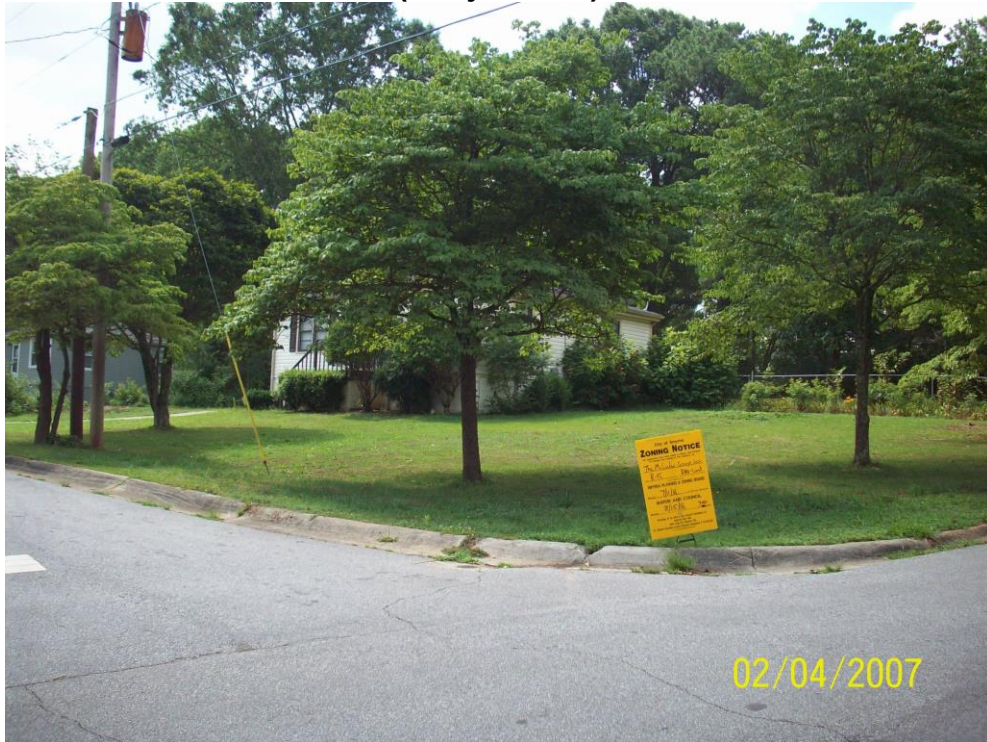
Figure – 1 (Subject Site)