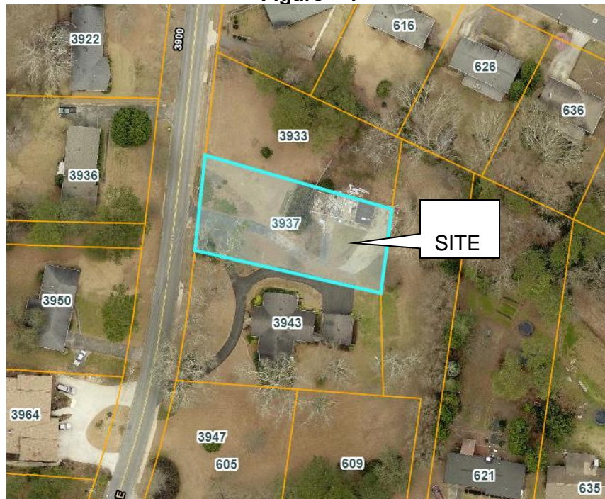
Figure – 1

According to Section 1403 of the Zoning Ordinance, variances must be reviewed under the following standards: (1) Whether there are unique and special or extraordinary circumstances applying to the property; (2) Whether any alleged hardship is self-created by any person having an interest in the property; (3) Whether strict application of the relevant provisions of the code would deprive the applicant of reasonable use of the property; and (4) Whether the variance proposed is the minimum variance needed. Community Development has reviewed the request against the variance review standards and found it not to be in compliance with any of the standards , based on the lack of hardship and the self-creation of the variance request. Staff is not supportive of reducing the driveway side setback when adjustments could be made to accommodate City code. Community Development believes there are no unique and special extraordinary circumstances applying to the property to justify the variance requested. Strict application of the ordinance does not deprive the subject property owner of reasonable use of the property, as the lot can accommodate a single-family home to Code. After a review of the standards above, Community Development recommends denial of the requested variance.