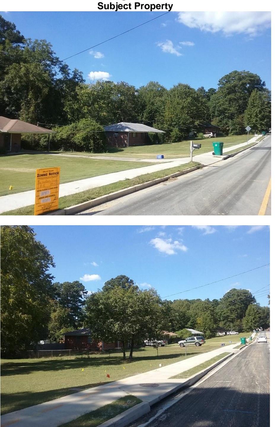
Figure – 1 Subject Property