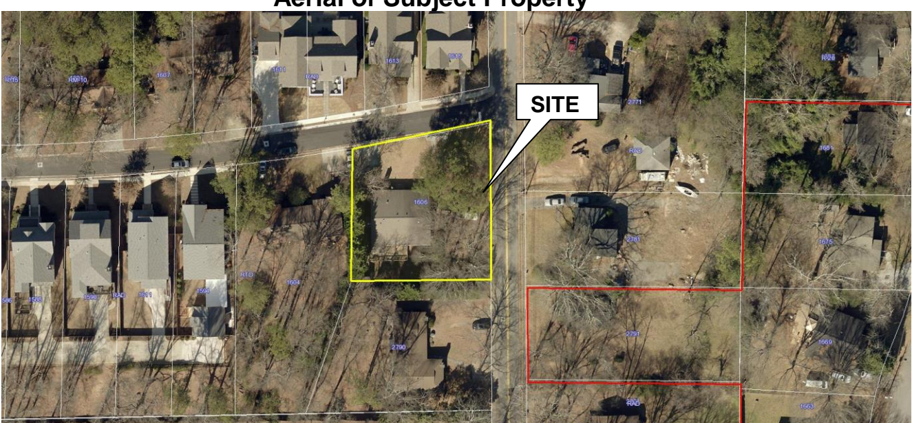
Figure – 1 Aerial of Subject Property

The applicant is requesting to deviate from the City's maximum allowable fence height in the front yard (Section 501.10 of the Zoning Ordinance) at 1606 Walker Street. According to Section 1403 of the Zoning Ordinance, variances must be reviewed under the following standards: (1) Whether there are unique and special or extraordinary circumstances applying to the property; (2) Whether any alleged hardship is self-created by any person having an interest in the property; (3) Whether strict application of the relevant provisions of the code would deprive the applicant of reasonable use of the property; and (4) Whether the variance proposed is the minimum variance needed. Community Development has reviewed the request against the variance review standards and found it to be in compliance. Community Development does believe there are sufficient privacy and security concerns that justify approval of the request. Additionally, several variances have been granted for similar requests throughout the City. At the time of this report Community Development has not received any opposition regarding the request. Therefore, Staff recommends <u>approval</u> of the requested variance.