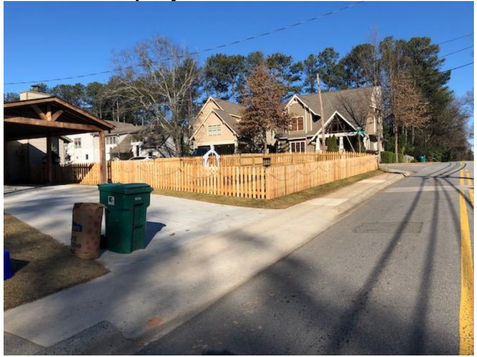
Figure – 3 Property from Mathews Street