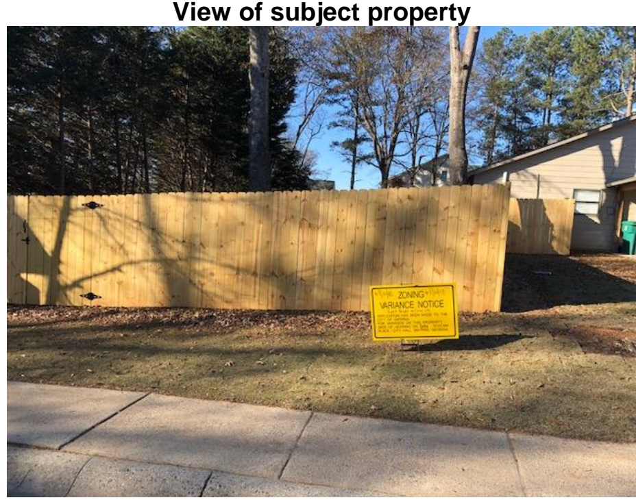
Figure – 2 View of subject property

VARIANCE CASE V18-001 January 10, 2018 Page 3 of 4