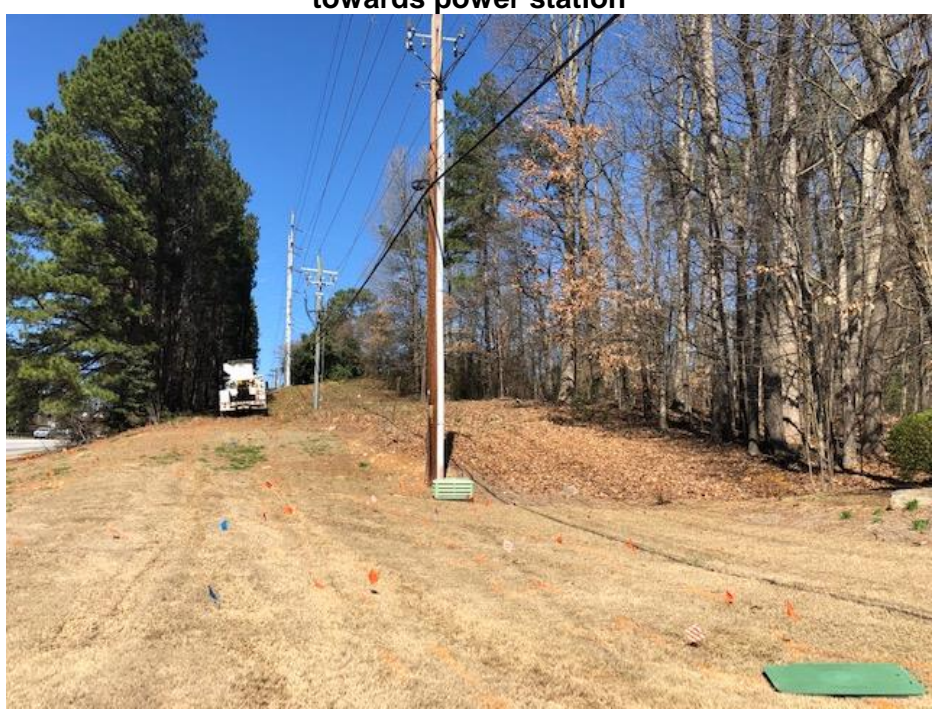
Looking west across S. Cobb Drive Delmar Gardens

Looking north along S. Cobb Drive towards power station