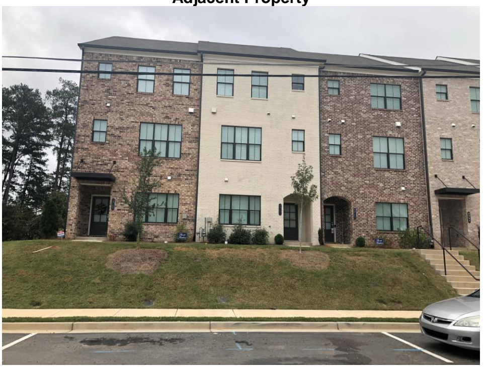
Figure – 5 Adjacent Property