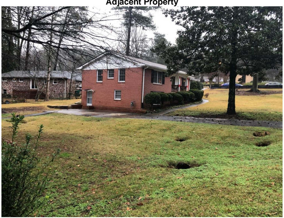
Figure – 8 Adjacent Property