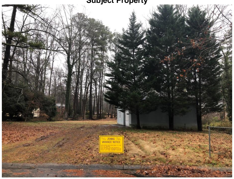
Figure – 4 Subject Property