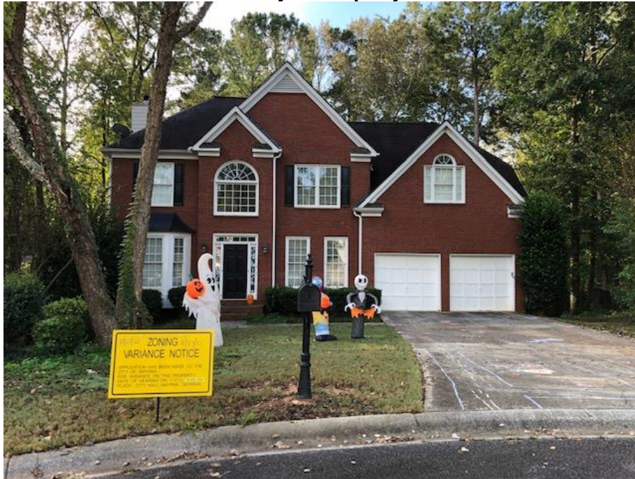
Figure – 4 Adjacent Property